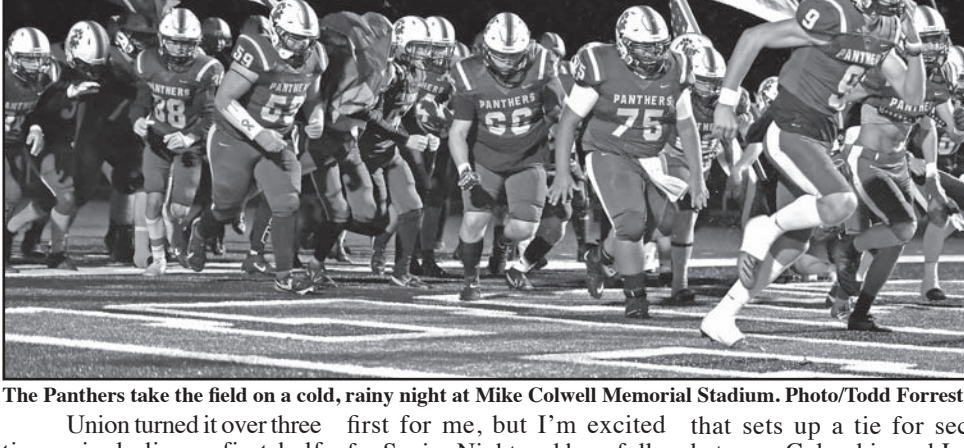
Union turned it over three first for me, but I'm excited that sets up a tie for second

The Panthers finished with 197 yards of offense with 132 coming on the ground. Rabun piled up 476 yards behind 256 yards rushing. The Wildcats scored on first-half runs of 25, 74 and 16 yards