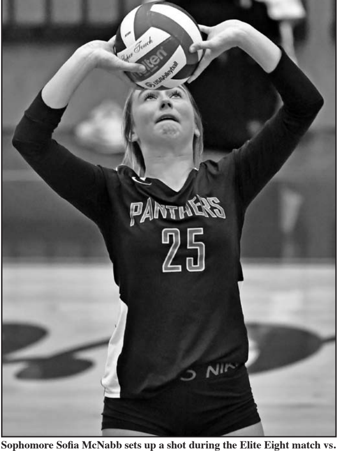
Dade County at UCHS. it 23-20 before Union surrendered Kills from Swartz and

across the board. Everyone contributed. They all did great to-